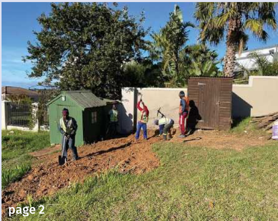
ADT Hut Upgrade