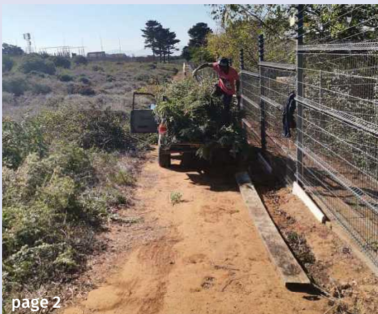
Back Fence Annual Clean Up