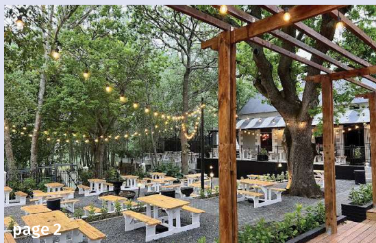
page 2 Die Nag Uil Oude Westhof